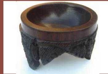
1.1. Ostrich Holder 1 Mahogany with natural rubber inset