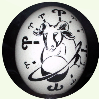
1.1. Zodiac Ostrich Eggs Please contact me for more details

Using a clean damp cloth or a wet wipe, remove any traces of dust or marks from the ostrich eggshell. Place a chopstick or similar object without any sharp edges on it, into the blown hole of the egg. This way you can apply the paint as it turns around. Disposable gloves are also useful for keeping your work clean.