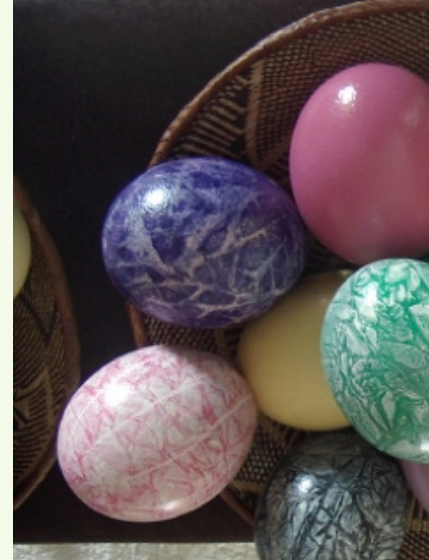
1.1. Marble 'effect' Ostrich Eggs Very easy to achieve, follow my techniques for great results

You can use instead two-litre fizzy drink bottles filled with sand. The sand is used to keep the bottles firmly in place. Push a chopstick or a smooth piece of strong wood similar in size into a bottle. Whilst holding your finished artwork