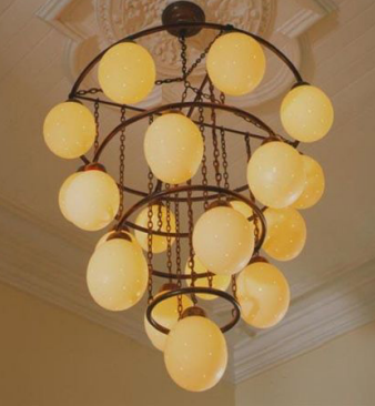
1.1. Ostrich Egg Chandelier installed at The Manderin Hotel, Las Vegas

the egg, sit the egg on a small cushion. This protects the egg from hard surfaces and helps you to do your artwork in a comfortable and accurate way. You will see examples of my work in the following pages to give you a few ideas.