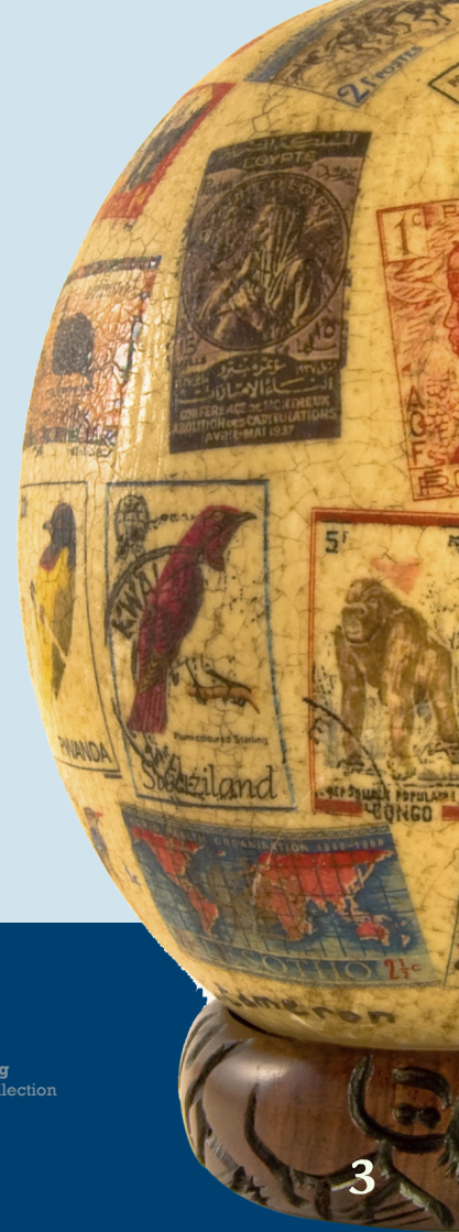
1.3. Typical Ostrich Egg Decoration. Private collection